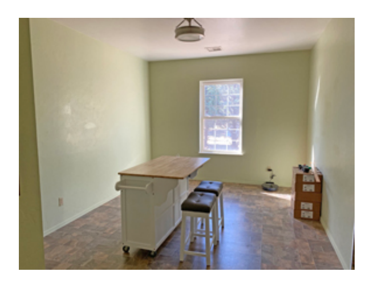
And now it is this: