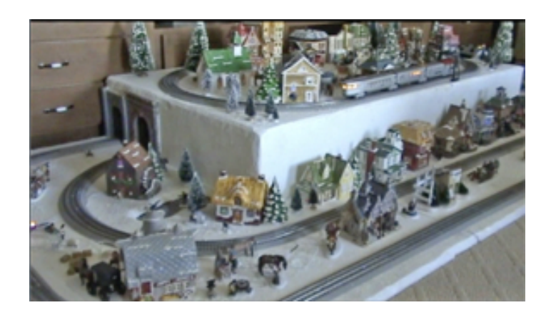
Is now this: