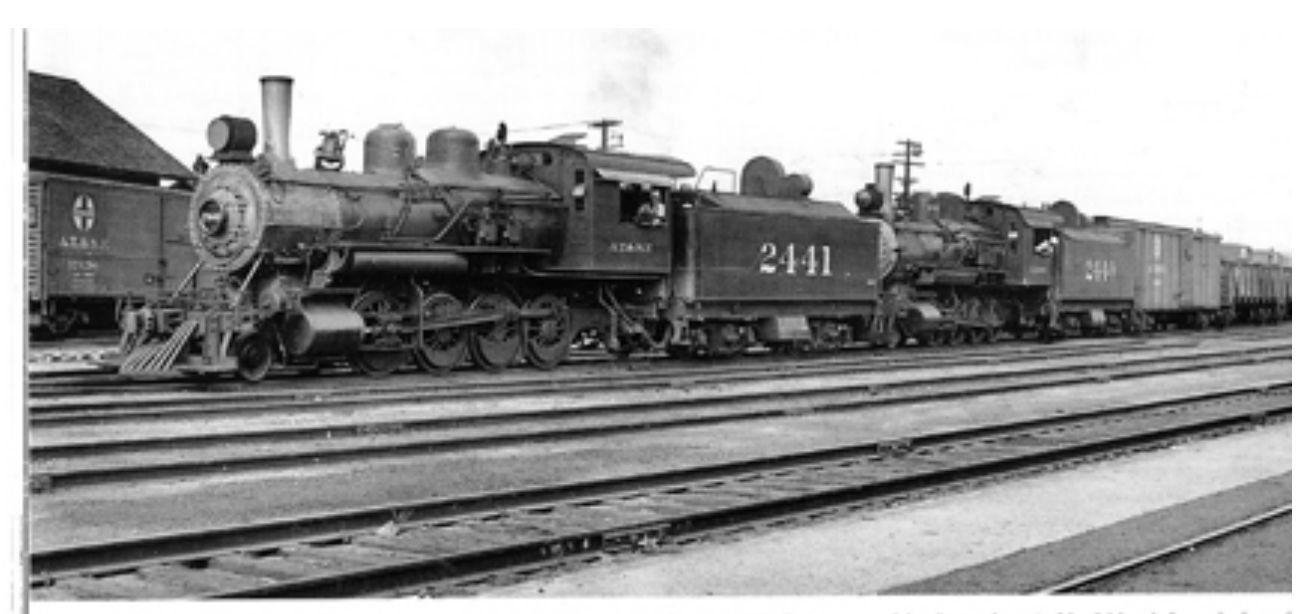
Train No. 25, the "Pollywog" returning to Prescott from the Mayor District in 1939. Operating on Mondays only, train No. 26 headed out the brand in the morning, turning at Blue Bell around 11:45 a.m., and securned to Prescott as No. 25. The trains, which originated and terminated at Prescott, operated as extras between Prescott yard and Entro before assuming their schedules on the Mayor District.